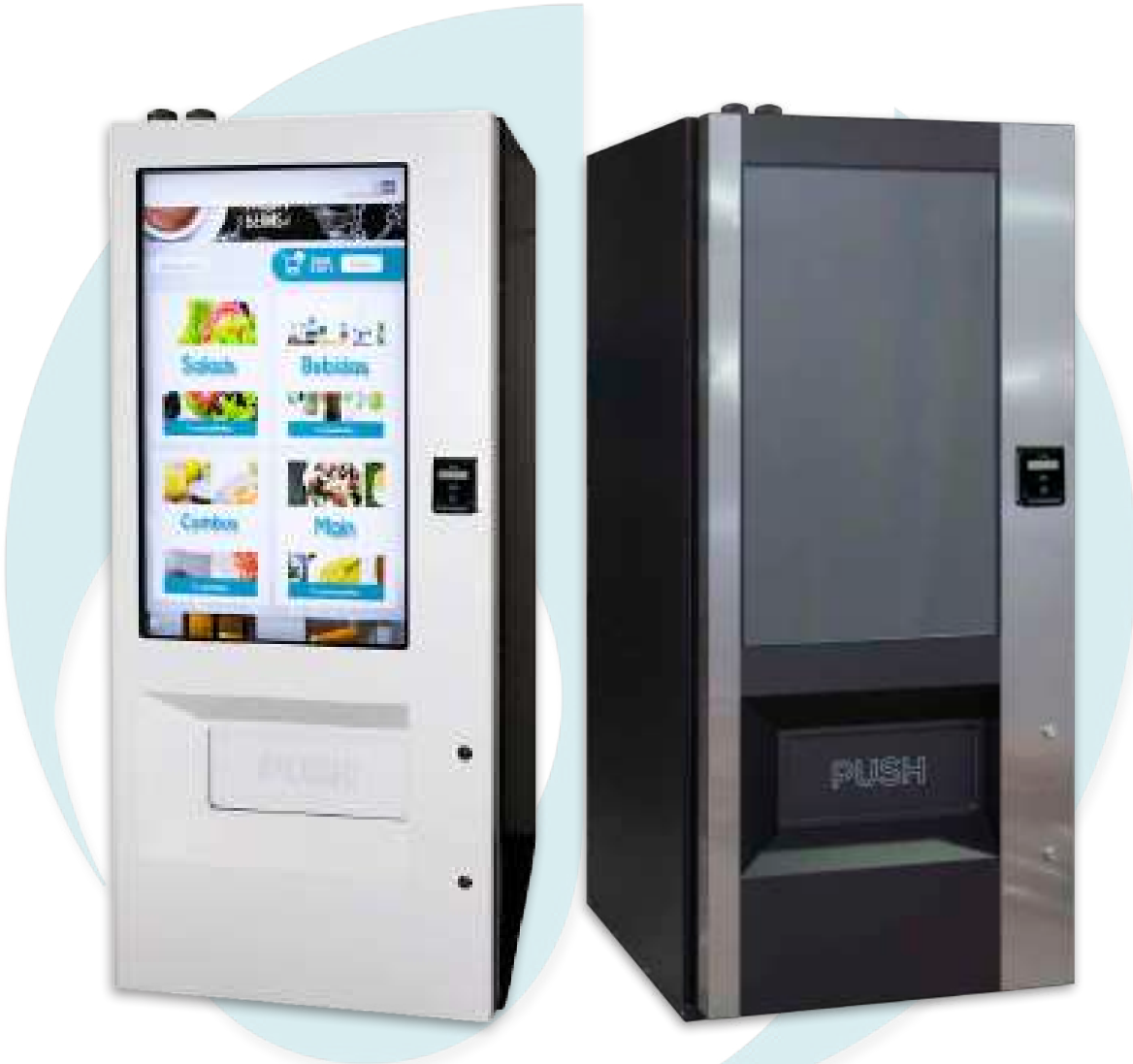
ESPlus Touch V8 Shopping experience

The greatest distinguishing feature of the ESPlus Touch V8 is its display; a large 43" touch screen that facilitates the user's shopping experience by making it more intuitive.