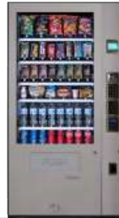
VISION ESPLUS V8 + CONTROL UNIT