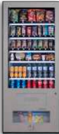
VISION ESPLUS V8