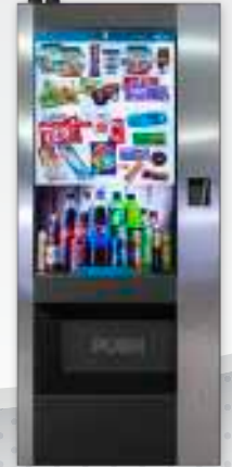
VISION ESPLUS TOUCH BLUETEC V8