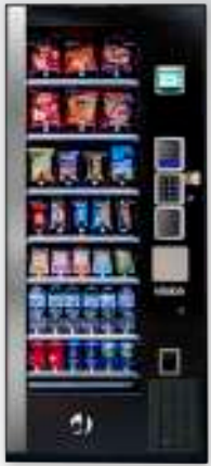
VISION COMBOPLUS BLUETEC V8