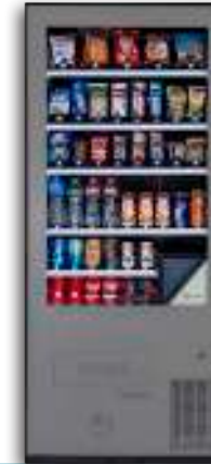
VISION SATELLITE V8

6 trays of max. 10 channels and 2 of up to 7 channels.