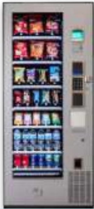
VISION COMBOPLUS V8