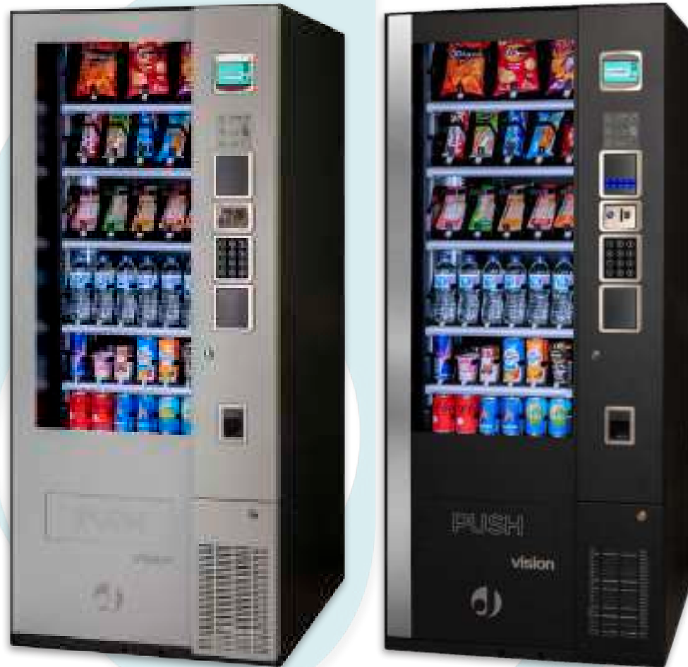
EasyCombo V8 Total control

Jofemar's Vision EasyCombo V8 allows the connection of up to 3 satellite modules, significantly increasing the product load.