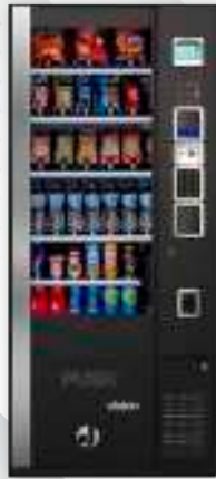
VISION EASYCOMBO BLUETEC V8