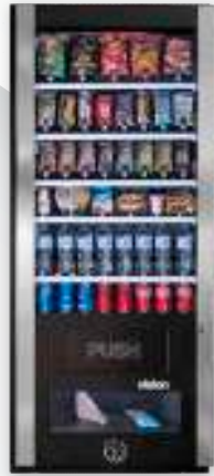
VISION ESPLUS BLUETEC V8