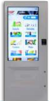
VISION ESPLUS TOUCH V8