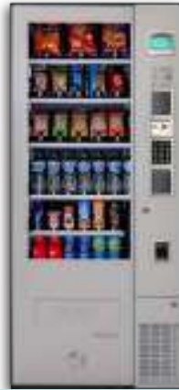
VISION EASYCOMBO V8

6 trays of max. 10 channels and 2 of up to 7 channels.