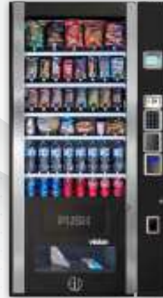
VISION ESPLUS BLUETEC V8 + CONTROL UNIT