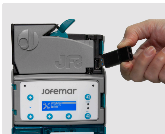
Updates and data extraction by USB port.