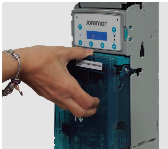
8 Refund tubes with possibility to unlock it by security code.